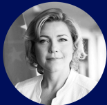
Henna Virkkunen , Executive Vice President, Tech Sovereignty, Security and Democracy